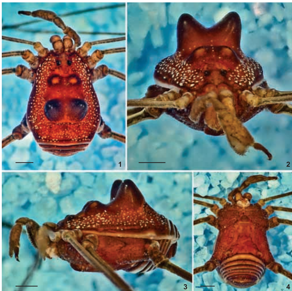
Figures 1-4. Roquettea decioi sp. nov., male holotype (MNRJ 7785), habitus: (1) dorsal view; (2) frontal view; (3) lateral view; (4) ventral view. Scale bars: 1 mm.

by cheliceral bulla armed posteriorly with several small acuminate teeth (Fig. 7) (instead of a few large blunt apophyses); by having a pair of mounds on scutal area I (instead of unarmed) and by having huge, erect, very thick protuberances on area III (instead of normal spines leaned backwards). Most similar to R. carajas in the dentition of the cheliceral bulla (Fig. 7) and the presence of two pairs of non-spiniform scutal protuberances on areas I and III, anterior low, posterior high (Figs 2 and 3). Distinguished from R. carajas by 1) protuberances of area I more defined as two mounds (instead of sprawled); 2) protuberances of area III even more massive, fused at base and clearly divergent (instead of not fused, parallel); 3) white dots of scutum not forming X between protuberances (instead of with clear X-pattern); 4) pedipalpal tibia (Fig. 5) with minimal ectal-apical expansion (instead of pseudo-finger expansion opposed to tarsus, forming a rudimentary chela).