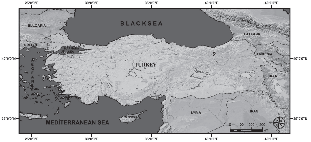
Fig. 1. Research area. 1: Gümüşhane province; 2: Bayburt province.

center), GŞİ (Gümüşhane, Şiran district), GKE (Gümüşhane, Kelkit district), GTO (Gümüşhane, Torul district), GKÜ (Gümüşhane, Kürtün district), GKÖ (Gümüşhane, Köse district), BME (Bayburt, center), BAY (Bayburt, Aydıntepe district), BDE (Bayburt, Demirözü district).